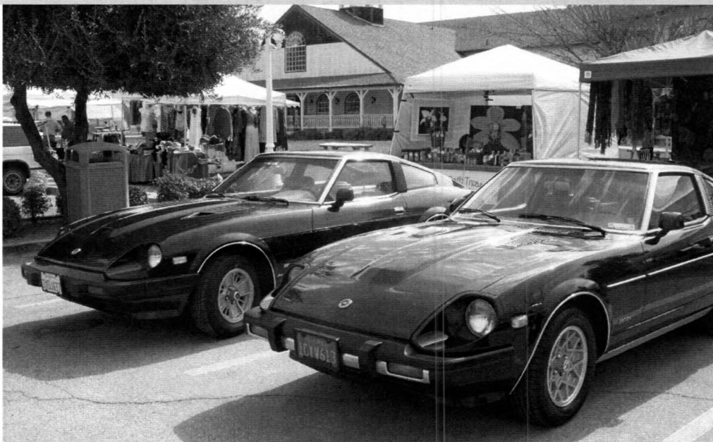
Z car sighting at wineries

Ross Kuzminsky Zedd Appliance- all appliance repairs, a/c and heating, and more Z club dis.. (858) 232-8364 call after 5 pm